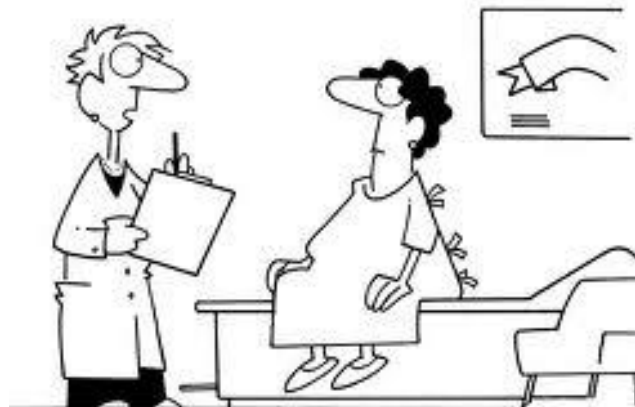
"The only diet shake I recommend is the shake your booty makes when you exercise."